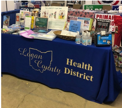
of LCHD Booth

Did you see us at the Logan County Fair this year? The Logan County Health District had a booth in the Merchants Building during fair week. While at the fair, LCHD provided COVID-19 vaccines, Narcan training, medication lock boxes, and information on programs that LCHD provides to the community. Information on the Children with Medical Handicaps program, Welcome Home Baby program, and our immunization clinic were among some of the programs represented. Many fair-goers visited the booth and were happy to see the Logan County Health District there, and grateful for the information that was provided. The Logan County Health District hopes to be at the fair next year and continue to provide the community with resources!